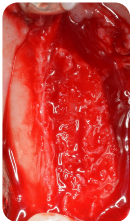
3mos PO tunnel